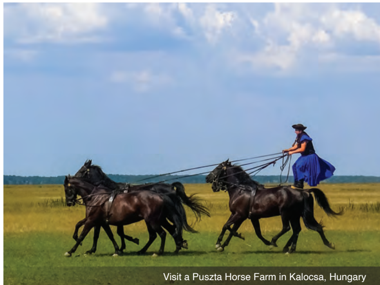
Visit a Puszta Horse Farm in Kalocsa, Hungary

DAY 1 Depart the USA: Depart the USA on your overnight flight to Bucharest, Romania.