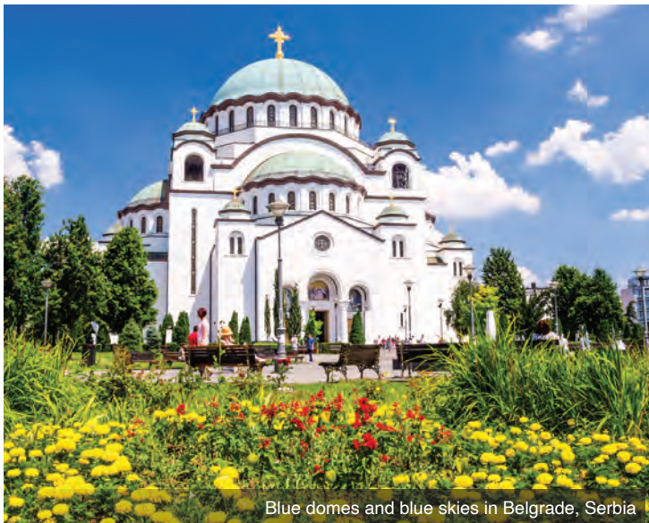
Blue domes and blue skies in Belgrade, Serbia